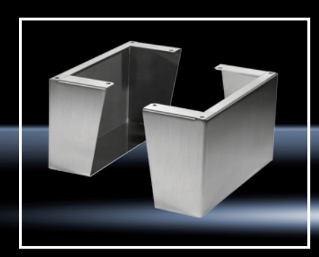
A floor stand kit permits easy access to the bottom of the enclosure. Purchased separately