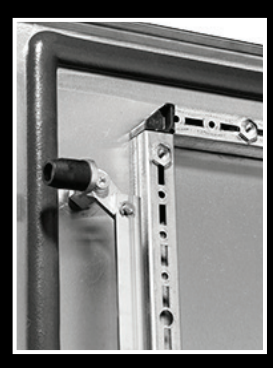
316 stainless steel four-point latching system and continuous foamedin-place gasket provides a water and dust proof environmental seal