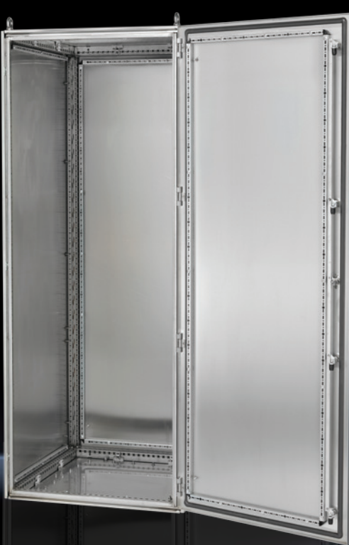
Note: Cabinet sidewalls are purchased as a separate item to complete assembly.